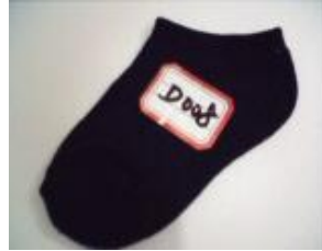
D008 S120N CHILDREN'S SOCKS TERRY ACRYLIC+3075SPANDEX