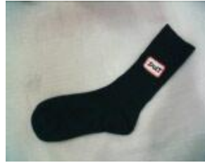
D055 D144N ANKLE SOCKS C/A+3075 SPANDEX