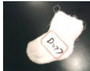
D077 S72N BABY'S SOCKS(TERRY) C+3075SPANDEX