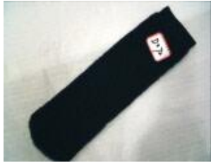
D072 S108N MENS'S SOCKS(TERRY) POLYESTER+3075SPANDEX