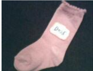
D025 S144N CHILDREN'S SOCKS COTTON+3075SPANDEX