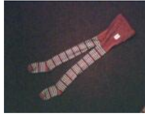
D063 S120N PANTIHOSE