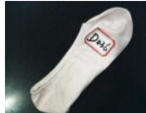
D036 S144N ladie'S SOCKS COTTON+3075SPANDEX