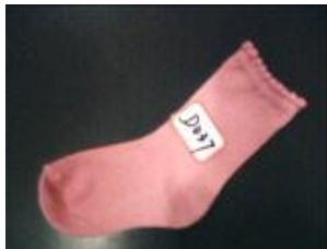
D037 S144N GIRL'S SOCKS acrylic+3075SPANDEX