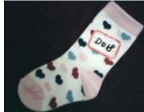
D018 S120N GIRL'S SOCKS COTTON+3075SPANDEX