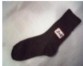
D065 DOUBLE LAYER SOCKS ACRYLIC+3075SPANDEX