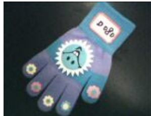
D080 GLOVES WITH PRINT A+3075SPANDEX