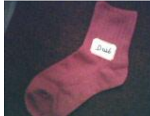
D026 D168N QUARTER SOCKS ACRYLIC+3075SPANDEX