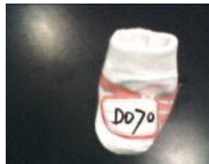
D070 S108N BABY'S SOCKS C+3075SPANDEX