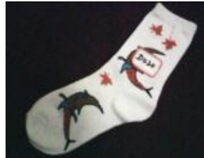
D020 S144N GIRL'S SOCKS COTTON+3075SPANDEX