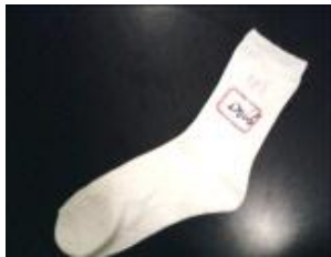
D066 D144N GIRL'S SOCKS(EMBROIDERY) C/A+3075SPANDEX