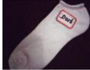
D016 S132N low cut SOCKS ACRYLIC+3075SPANDEX