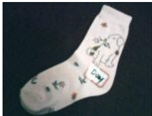
D021 S144N GIRL'S SOCKS COTTON+3075SPANDEX