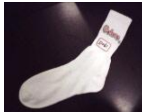
D061 S108N SPORTS SOCKS(TERRY) C/A+3075SPANDEX