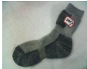
D057 S132N QUARTER SOCKS TERRY C/A6535+3075 SPANDEX