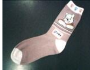
D040 S144N GIRL'S SOCKS acrylic+3075SPANDEX