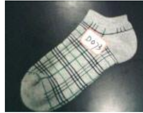
D073 S132N MENS'S SOCKS(TERRY) CA+3075SPANDEX