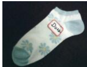
D022 S144N GIRL'S SOCKS COTTON+3075SPANDEX