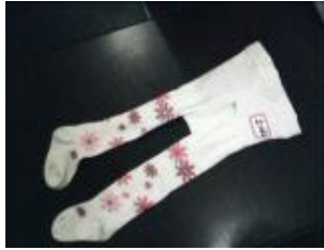
D062 S120N PANTIHOSE