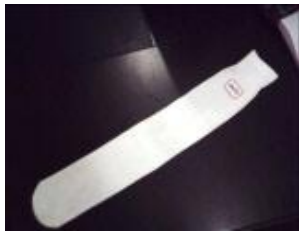
D060 S108N TUBE SOCKS(TERRY) POLYESTER+3075SPANDEX