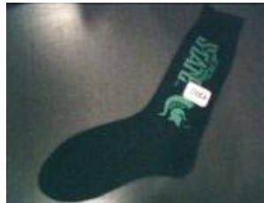
D053 S200N SCHOOL SOCKS COMED COTTON +3075 SPANDEX