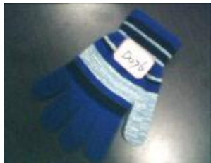
D076 GLOVES A+3075SPANDEX