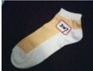
D017 S144N LOW CUT SOCKS ACRYLIC+3075SPANDEX