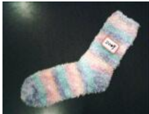
D049 S56N FEATHER YARN SOCKS POLYESTER+SPANDEX