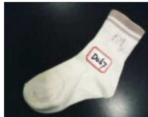
D067 S144N GIRL'S SOCKS(EMBROIDERY) C/A+3075SPANDEX