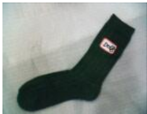
D068 S132N MENS'S SOCKS(TERRY) C+3075SPANDEX