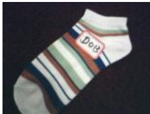
D013 S120N GIRL'S SOCKS ACRYLIC+3075SPANDEX