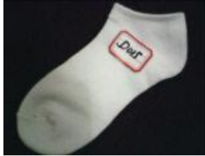
D015 S120N GIRL'S SOCKS ACRYLIC+3075SPANDEX