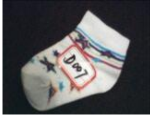
D007 S120N CHILDREN'S SOCKS ACRYLIC+3075SPANDEX