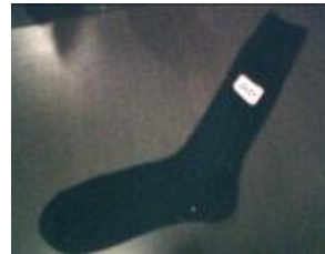
D050 D168N MERCERIZED COTTON SOCKS MECERISED COTTON+NYLON