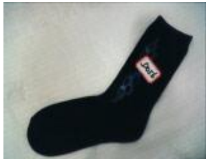
D056 S144N QUARTER SOCKS ACRYLIC+3075 SPANDEX