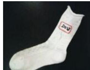
D038 S144N GIRL'S SOCKS acrylic+3075SPANDEX