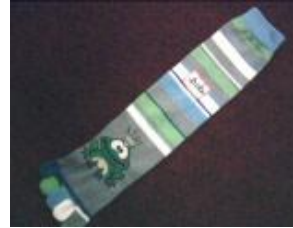
D032 13G TOE SOCKS jacquard ACRYLIC+3075SPANDEX