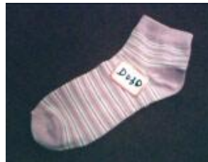
D030 S120N GIRL'S SOCKS ACRYLIC+3075SPANDEX