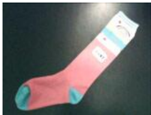
D045 S144N KNIEE HIGH SOCKS C65/A35+3075SPANDEX