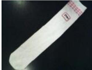
D041 S200N TUBE SOCKS acrylic+3075SPANDEX