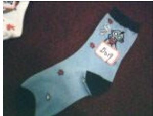
D019 S144N GIRL'S SOCKS COTTON+3075SPANDEX