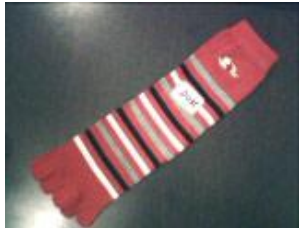
D035 embodiery toe SOCKS ACRYLIC+3075SPANDEX