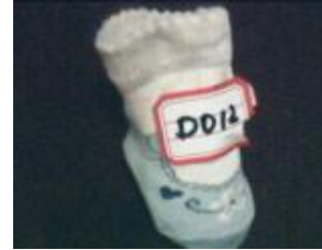
D012 S108N BABY'S SOCKS COTTON+3075SPANDEX