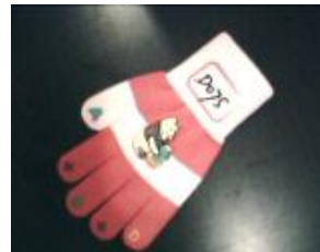
D075 GLOVES WITH PRINT A+3075SPANDEX