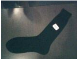
D051 S200N MERCERIZED COTTON SOCKS MECERISED COTTON+NYLON