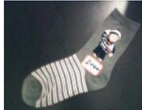
D042 S144N GIRL'S SOCKS acrylic+3075SPANDEX