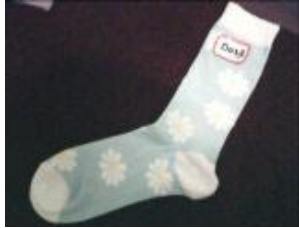
D023 S144N GIRL'S SOCKS COTTON+3075SPANDEX