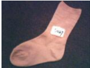
D027 D168N QUARTER SOCKS ACRYLIC+3075SPANDEX