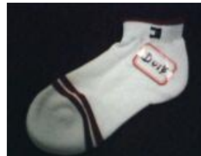
D014 S144N SPORT'S SOCKS(TERRY) T/C+3075SPANDEX