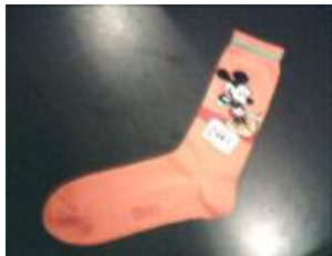
D064 S144N GIRL'S SOCKS COTTON+3075SPANDEX