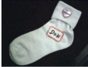
D031 D144N CUFF SOCKS acrylic+3075SPANDEX