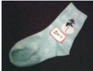
D011 S120N GIRL'S SOCKS ACRYLIC+3075SPANDEX