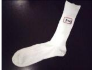
D039 D144N CREW SOCKS(BAMBOO YARNS) COTTON+3075SPANDEX