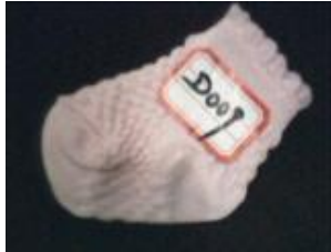
D009 S108N CHILDREN'S SOCKS COTTON+3075SPANDEX