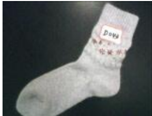
D043 S144N WOOL SOCKS 10% ANGORA,20% WOOL,60% ACRYLIC 10% NYLON