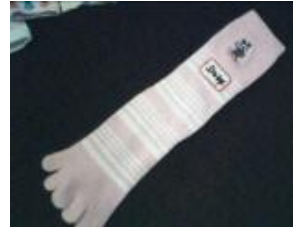
D034 embodiery 13G TOE SOCKS ACRYLIC+3075SPANDEX