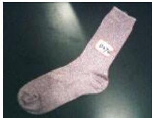
D074 D144N LUREX'S SOCKS A+3075SPANDEX