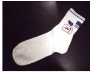
D059 S168N SPORTS SOCKS COTON+SPANDEX