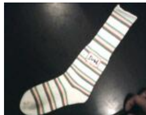
D046 S144N KNIEE HIGH SOCKS A+3075SPANDEX