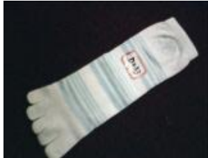
D033 embodiery 13G TOE SOCKS ACRYLIC+3075SPANDEX