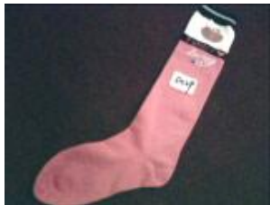
D029 S144N ladie'S SOCKS ACRYLIC+3075SPANDEX