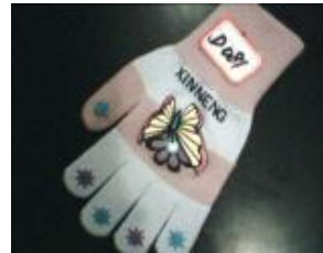
D081 GLOVES WITH PRINT A+3075SPANDEX