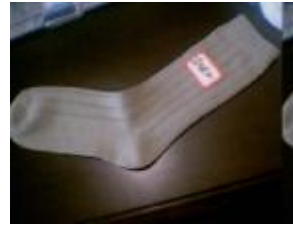
D052 D84N QUARTER SOCKS BULK ACRYLIC +3075 SPANDEX