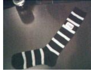
D048 S144N KNIEE HIGH SOCKS A+3075SPANDEX