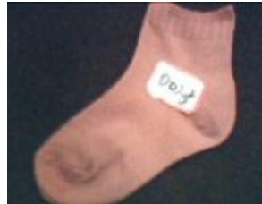
D028 D168N QUARTER SOCKS ACRYLIC+3075SPANDEX