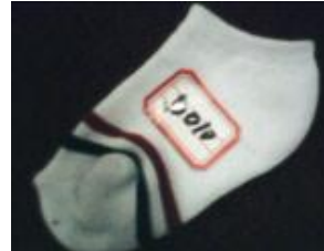
D010 S120N CHILDREN'S SOCKS(TERRY) ACRYLIC+3075SPANDEX