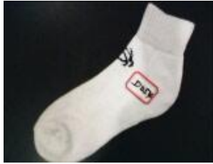
D054 S132N ANKLE SOCKS(TERRY) COTTON +3075 SPANDEX