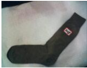
D058 S200N BUSINESS SOCKS NYLON