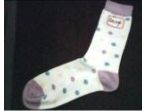
D024 S144N GIRL'S SOCKS COTTON+3075SPANDEX