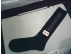
D047 S144N KNIEE HIGH SOCKS ACRYLIC+3075SPANDEX