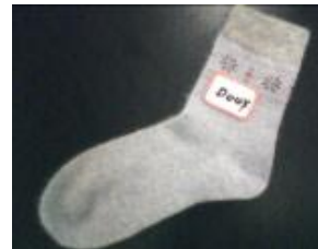
D044 S144N WOOL SOCKS 10% ANGORA,20% WOOL,60% ACRYLIC 10% NYLON